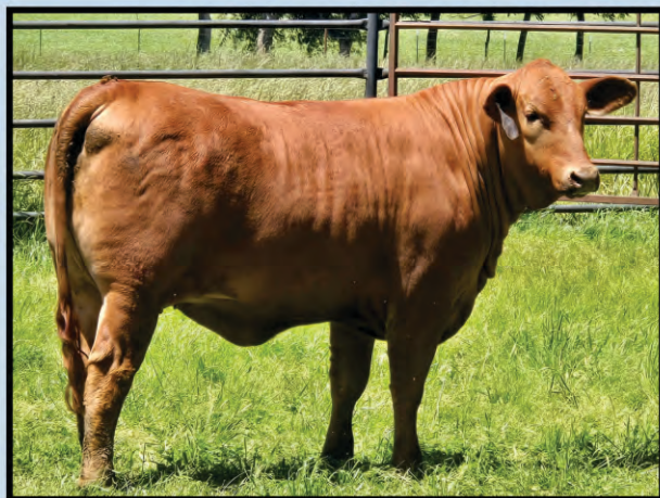
LOT 2I 2544 WPR CHARLENE