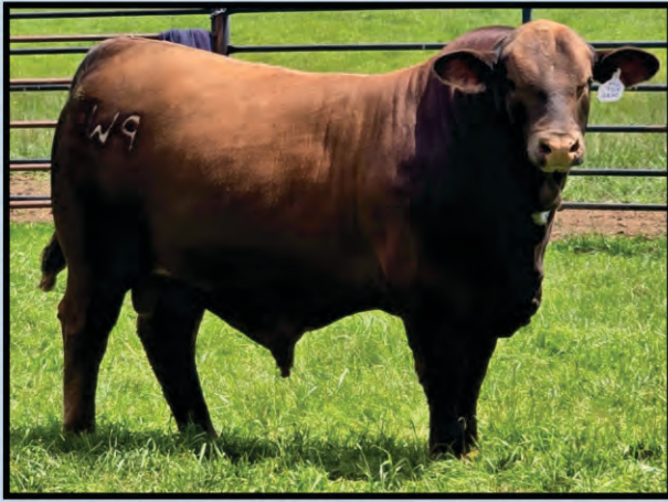
LOT 22 2502 WPR HOT DEAL