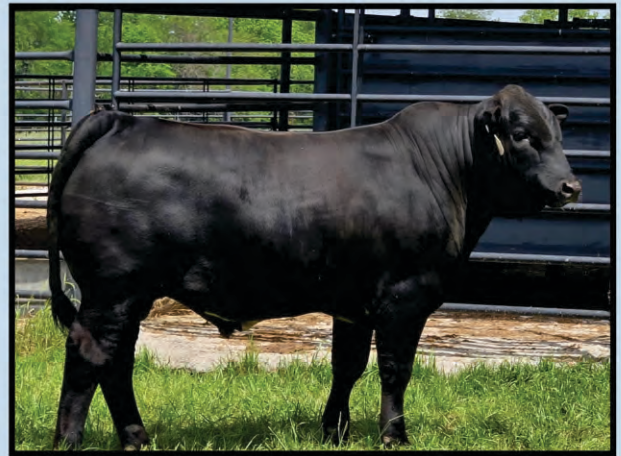
LOT 26 2541 WPR APOLLO