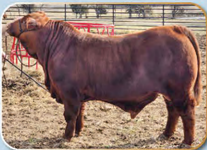
WPR World Class C1161474

Homo red and polled, sire to and service sire to several lots in the sale.