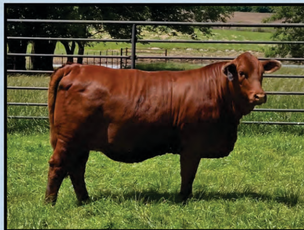
LOT 3 2501 WPR CHARISMA