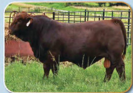
WPR Superfreak C1193167

Polled, scurred, sire to several lots in the sale.