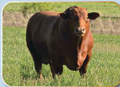
WPR Rawhide C1151816

Homo polled, homo red, 10 mos. old in photo. Sire to several lots in the sale.