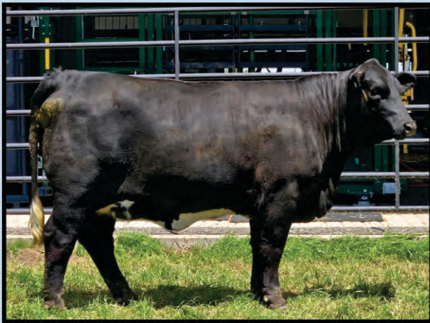
LOT 28 2471 WPR BLACK PASSION