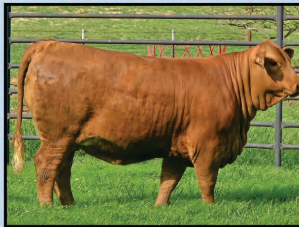
LOT 2G 2514 WPR ARABELLA ET