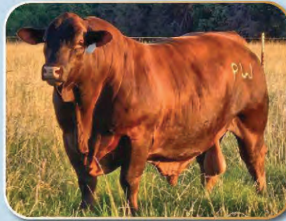
WPR Leading Edge C1138618

Homo polled, sire to several lots in the sale.