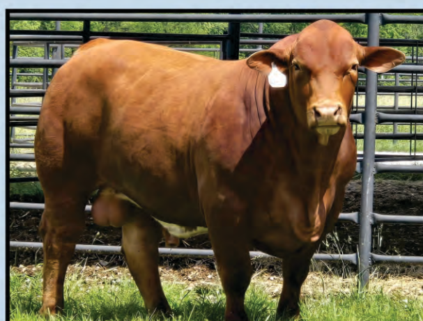
LOT 21 2457 WPR DUKE