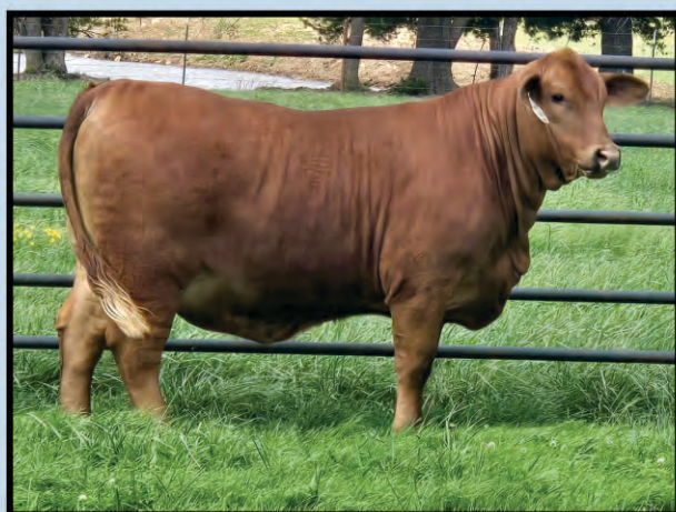
LOT 5 2504 WPR CLASSY LADY