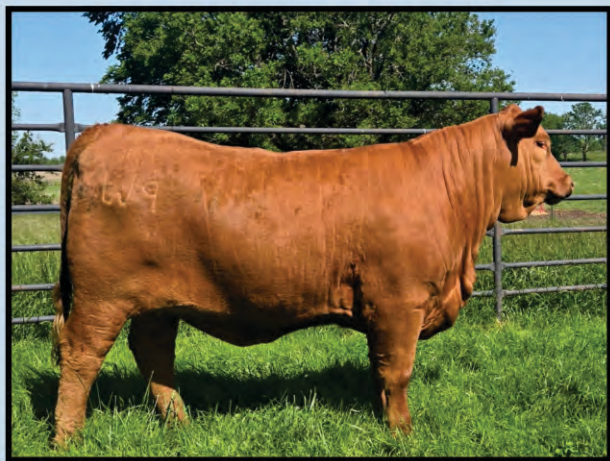
LOT 2A 2506 WPR EXQUISITE ET