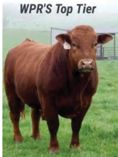
WPR'S Top Tier

ID #: 1729 WPR'S TOP TIER BREEDER: WALLEN BBU #: C1086388 DOB: 5-10-17 COLOR: DARK RED DNA: 41817023345 PV HORN: SCURS