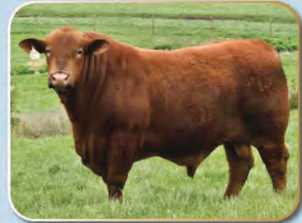
WPR Bringing Sexy Back C1167871

Homo red and polled, sire to several lots in the sale.