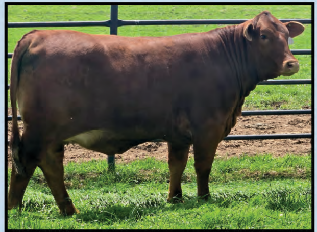
LOT 29 2474 WPR PLEASURE