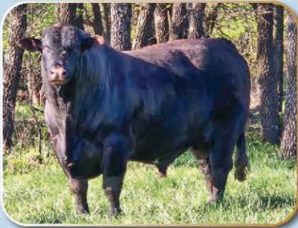
WPR Change It Up C1151125

Selling 60+ Lots of Top Quality, Mostly Polled Animals, Semen & Embryos