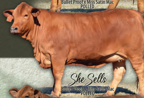
She Sells Bullet Proof x Miss Satin Mac POLLED