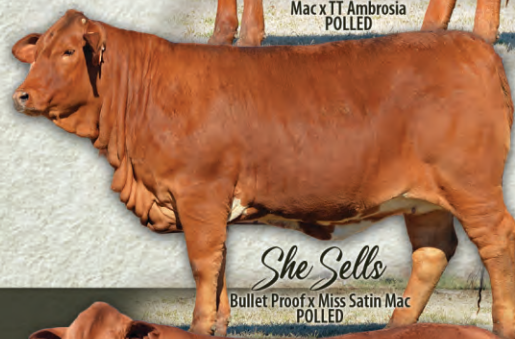
She Sells Bullet Proof x Miss Satin Mac POLLED