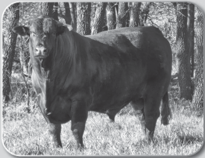
WPR Change It Up C1151125

Selling 60+ Lots of Top Quality, Mostly Polled Animals, Semen & Embryos