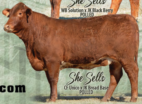
She Sells CF Unico x JK Broad Base POLLED