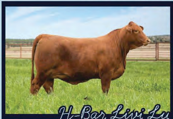
H-Bar Live Lu