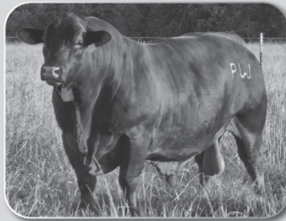
WPR Leading Edge C1138618

Homo polled, sire to several lots in the sale.