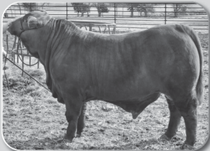
WPR World Class C1161474

Homo red and polled, sire to and service sire to several lots in the sale.