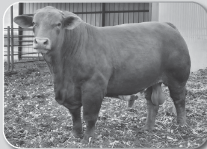
WPR Rawhide C1151816

Homo polled, homo red, 10 mos. old in photo. Sire to several lots in the sale.