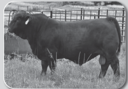
WPR Superfreak C1193167

Polled, scurred, sire to several lots in the sale.