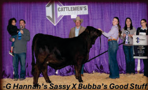
-G Hannah's Sassy X Bubba's Good Stuff

2024 HLSR Grand Champion & Reserve Supreme American