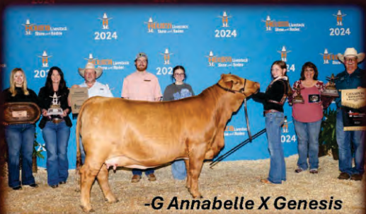
-G Annabelle X Genesis

2024 HLSR Grand Champion & Reserve Supreme American