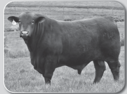
WPR Bringing Sexy Back C1167871

Homo red and polled, sire to several lots in the sale.