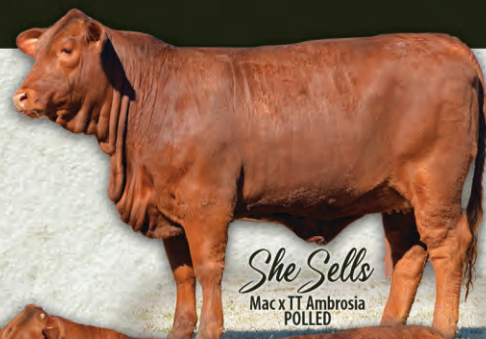
She Sells Mac x TT Ambrosia POLLED