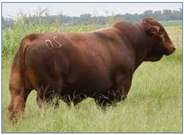
PERFORMANCE MODEL · Sire of Lots 1-4

JK High Road is very deep and long bodied. She is also super smooth, feminine and fancy fronted on a heavy boned frame. We crossed AVA with Phantom soon after we bought her because we knew we would get super productive and heavy milking females like Halloween Phantom. The Lady Phantom cow families are legendary for all maternal traits in our breed. Breed for top proven maternal traits and it is hard to go wrong.