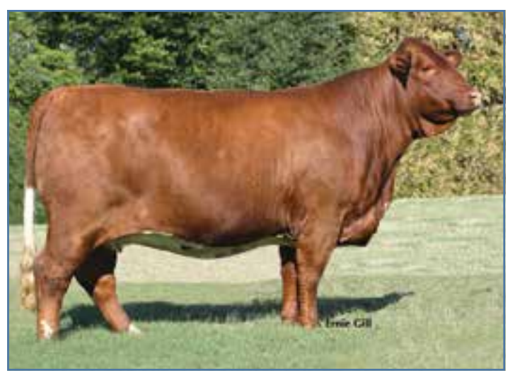
AVA · Dam of Lots 22-31

JK Grand Field is a prime example of why we think so much of the Genesis combination on the great Ava donor. This heifer is loaded with power and thickness. She is straight topped and square hipped on a wide base. Top 25% $T. Top 15% $M.