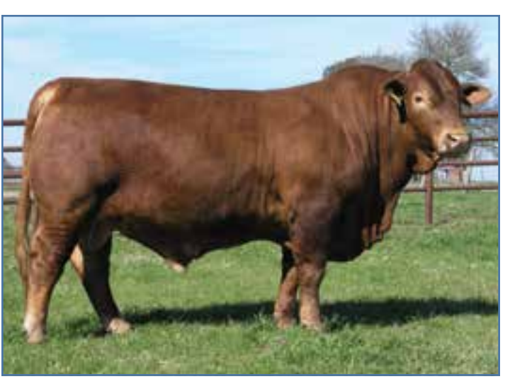
VISION 905 · Sire of Lot 34

Our legacy donor, Achtung Model, really pulled it off here with Vision on this polled beauty. The Logan and Vision cross on this donor both worked well many times. This heifer has all the depth, length and smoothness you want and with her genetics, she will perform in the pasture. Top 15% IMF. Top 20% $M.