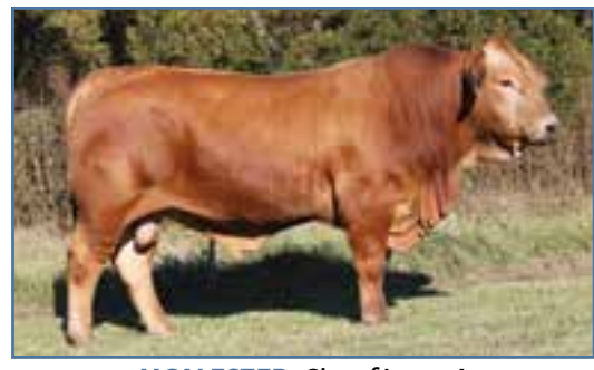
MCALESTER · Sire of Lot 48A