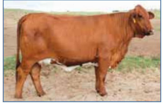
AUBURN LADY · Dam of Lot 50