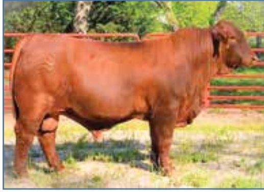
DC RANGE BOSS · Service Sire to Lot 59