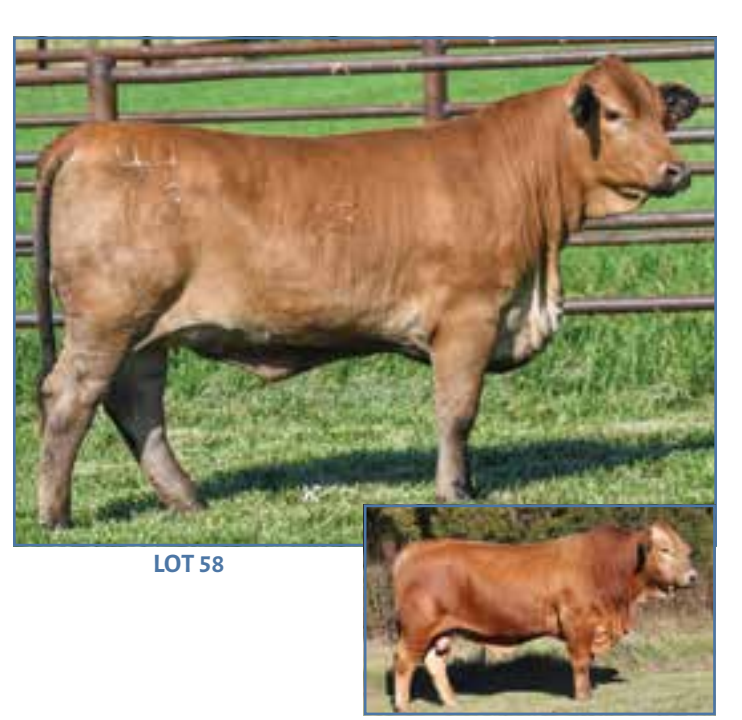
MCALESTER · Sire of Lot 58

44F3, a daughter of McAlester, embodies pure power genetics on all fronts. Couple her performance with her wide-topped, deep-bodied design and you have a no fail breeding piece to add to your herd. When deciding to part with this McAlester daughter we wanted to bring a female with the attributes her sire is so well known for. Rankings in the 3% for WWT, YWT, SC, and 2% for $T and $M insure she will be adding value to any program.