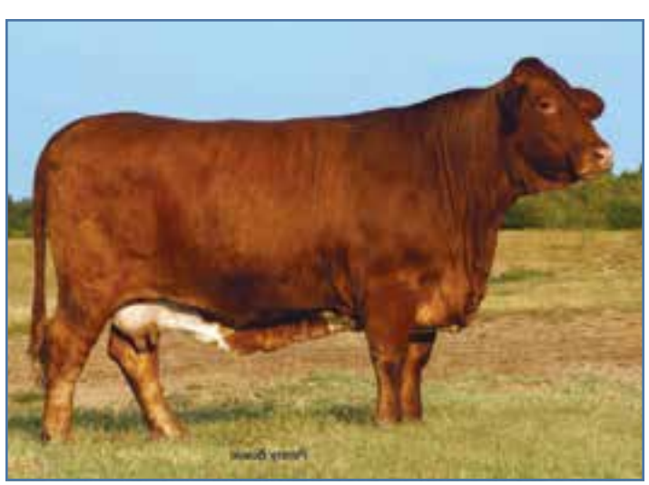
ACHTUNG · Maternal grandam of Lots 9& 10

Master Piece and Tiger Blood consistently hit on long, thick feminine females like this heifer and her full sister who sells as Lot 9. You can't ask for more length spread over a straight top line, square hip and ample bone. JK Tribune is thick made and built for growth and milk production. Top 15% $T. Top 35% $M. These two full sisters represent Kreger genetics going back nearly three decades with emphasis on fertility, consistency, heavy milking and dependability.