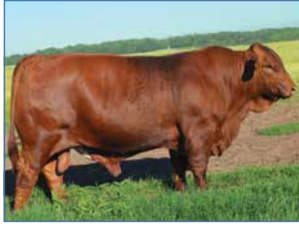
JK OKLAHOMAN · Sire of Lot 47 · Maternal Sib to Lot 48

BW ww YW MILK TM MCE SC REA %IMF RIBF $T 0.0 19.9 36.0 13.1 23 2.5 .00 -.49 .12 -.035 64.18 17.02