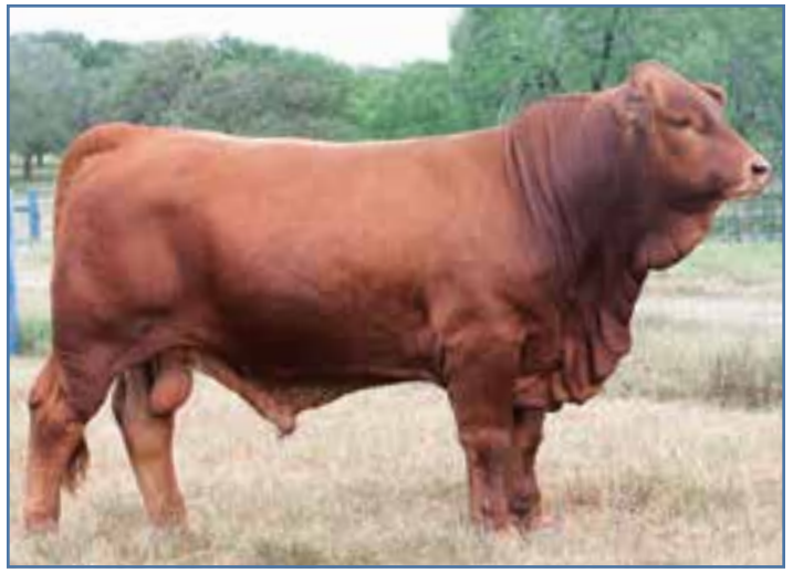
PRODICY L2 161/13 · Sire of Lots 12 & 14

In this sale, we are providing a significant offering of JK Achtung Model daughters. We have horded them for years because this donor produced so many top herd sires. JK Allure is one that is hard to give up. We only made two heifers out of her with L2 Prodigy. She is so long, straight topped and level hipped. She exhibits striking eye appeal with exceptional femininity, class, clean lines and heavy bone.