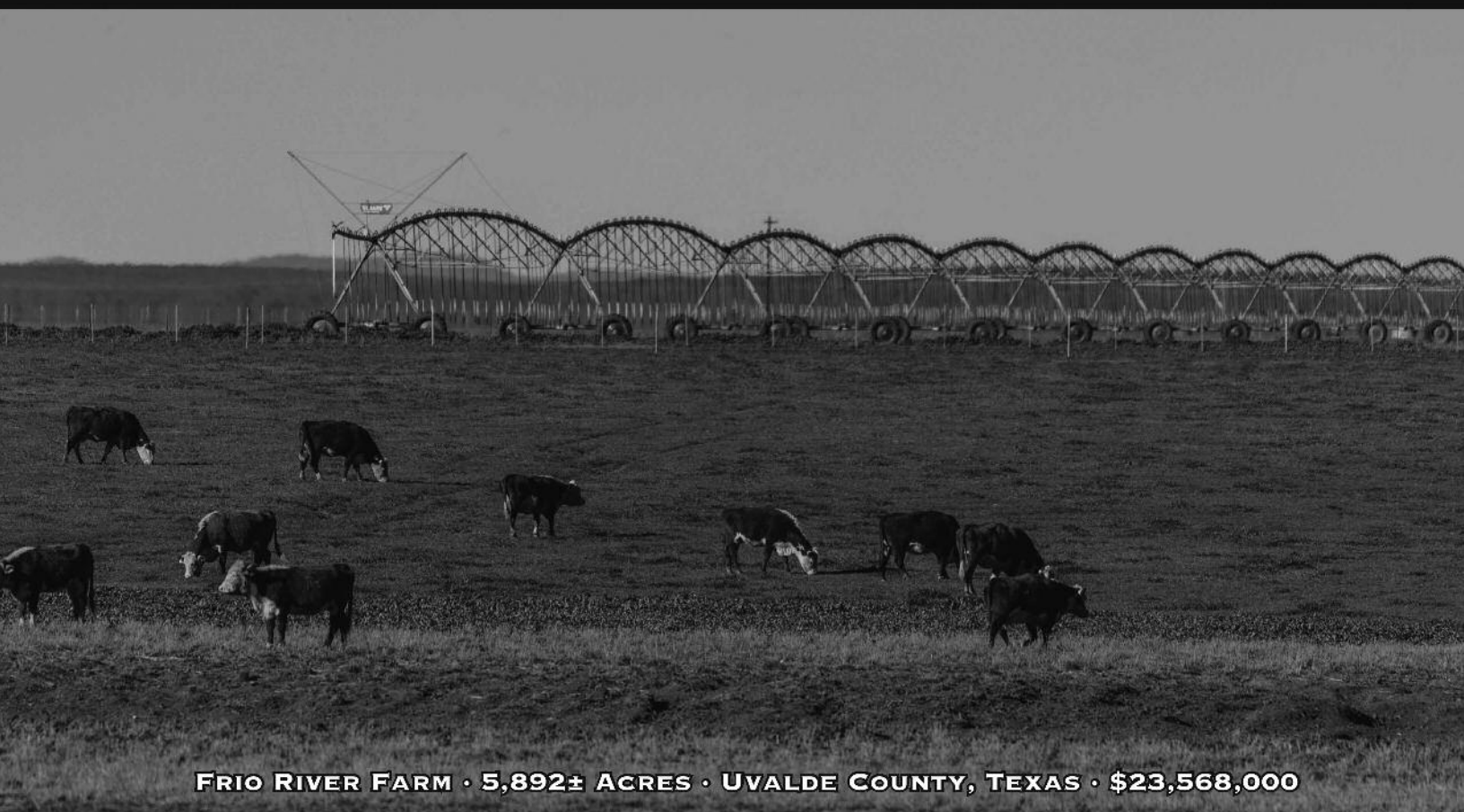
FRIO RIVER FARM · 5,892± ACRES · UVALDE COUNTY, TEXAS · $23,568,000