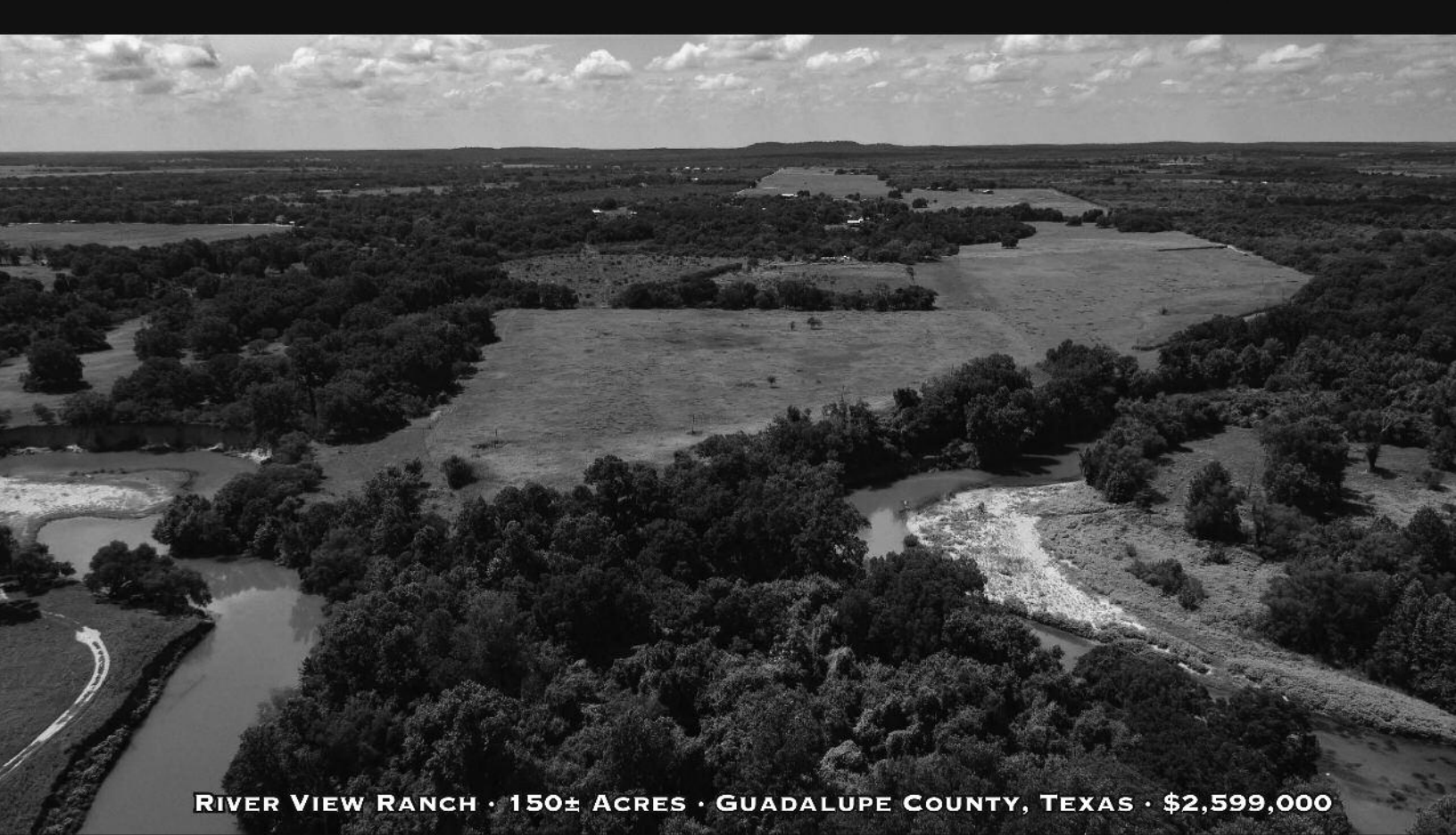
RIVER VIEW RANCH · 150± ACRES · GUADALUPE COUNTY, TEXAS · $2,599,000