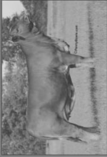
SWB Rose Petals - CF Adonis X SWB Lovely