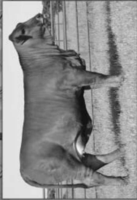
SWB Crybaby 04815 Bullet Proof X Jazzie