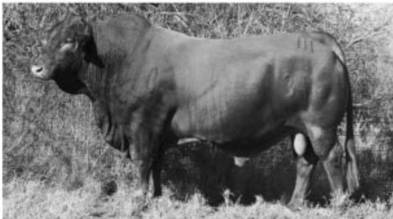
Fall 2016 EPDs

COLONEL TOM—C989984—DOB 11/29/99 TOP 3% REA, IMF TOP 5% WW, YW, $T, $M $35 Per Straw With A.I. Certificate Included 10 Straw Minimum