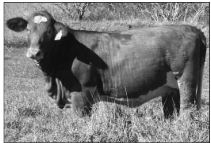
Lot 30: Rancho Tres Hijos LP 6/6

This is a very fancy, red, star faced heifer with a white underline sired by Red Bayou out of a Logan granddaughter. She has an excellent pedigree with 6 Typesetters in her genetics.