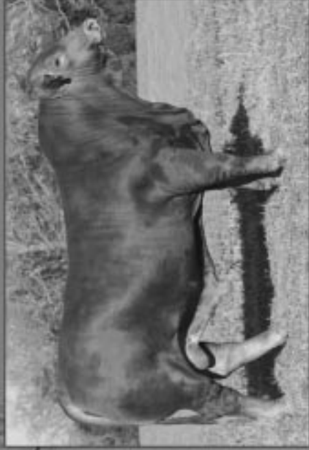
EMS Fire House

Heavy bred by sale to Luckenbach (C1047176)