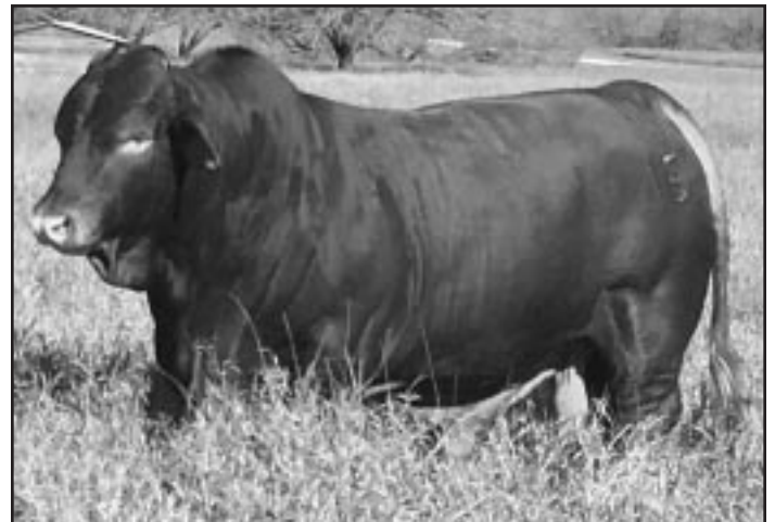
Lot 27: Rancho Tres Hijos LP 15/5

This is a solid red, very thick son of Fabulous Las Vegas, out of Captain Sugar and Oasis. His dam is sired by El Duque, a Nolan Ryan bull with a lot of Forty-Four influence. Her dam brings Encore and more Forty-Four into his genetics. His REA measurement was more than 9.5 and his IMF was 2.2. He will make an excellent herd bull and bring lots of thickness to your cattle.